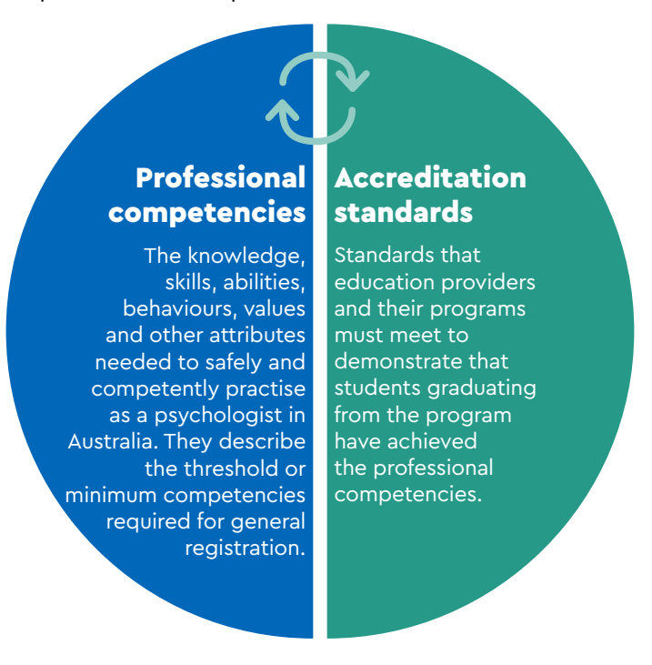
Figure 1: Relationship between professional competencies and accreditation standards

Professional competencies are typically referenced or embedded in the accreditation standards for approved programs of study and considered as part of the assessment of programs and providers. The competency requirements for a Board-approved qualification are detailed in the <u>APAC Accreditation standards for psychology programs</u> (the APAC standards). The accreditation standards require education providers to design and implement programs and curriculum that map to all the professional competencies for psychology (see Figure 1).