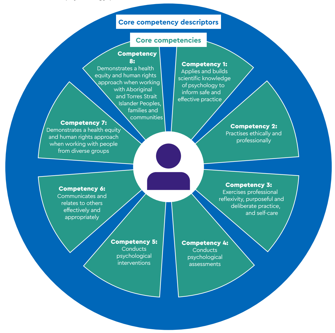
Figure 3: Safe and effective psychology practice