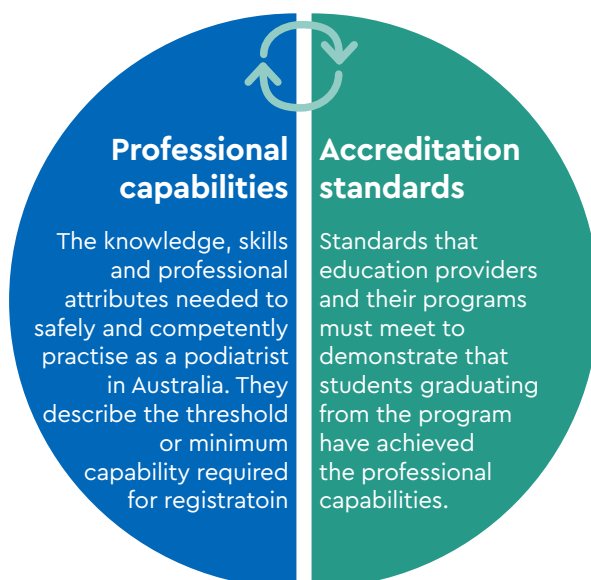
Figure 1: Relationship between professional capabilities and accreditation standards